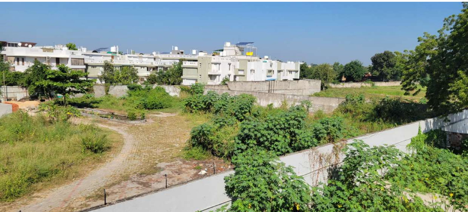
DP Road from Noor -3 side