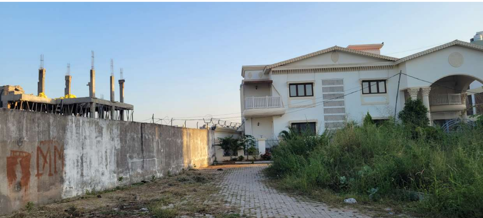
DP Road from Noor -3 side